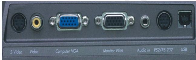
The ImagePro8753 inputs are easily accessible. Connecting your computer is quick and easy.

The Dukane ImagePro 8753™ is a full-featured multimedia projector, which employs the latest LCD technology to produce vibrant saturated color images. Using XGA native resolution of 1024 x 768 pixels it will display virtually any computer or video image. With a light output of 1100 ANSI lumens and a contrast of 400:1, the image is clearly visible in classrooms and offices. This projector is an exceptional value while still providing easy operation in schools and business locations. It has simple controls, is ultra quiet, can be ceiling or table mounted, has digital keystone correction, operates with automatic image